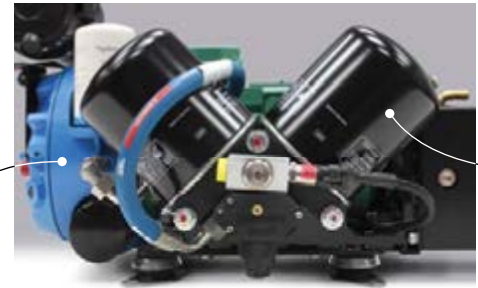
T02 Compact Vane air end

A new compact vane module has been designed specifically to offer weight and space savings in addition to class-leading efficiency and economy performance.