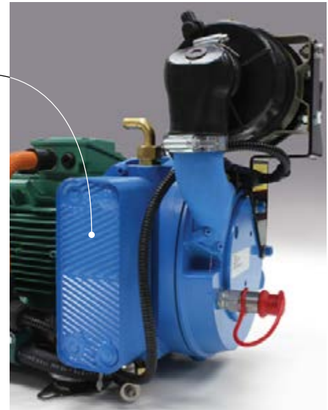
Integral oil/water heat exchanger