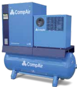
Complete airstation including compressor, dryer and receiver