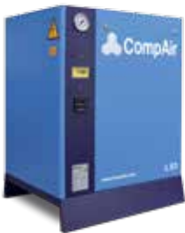
Compressor base mounted